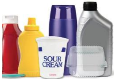
Squeeze bottles, yogurt, sour cream, or motor oil containers.