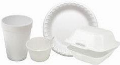
Styrofoam boxes or cups