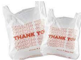
Plastic bags or plastic wrap. Recyclable do not need to be bagged.