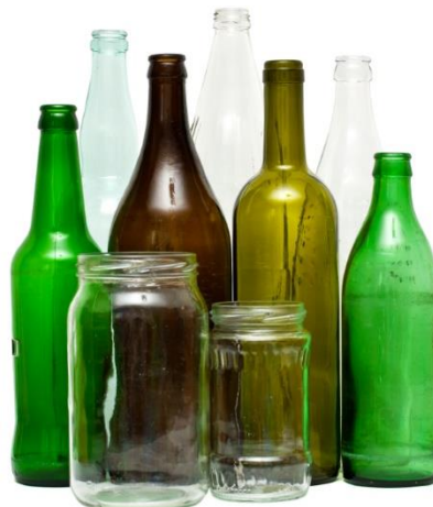
Glass bottles, jars, etc.