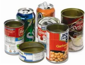
Aluminum and steel cans